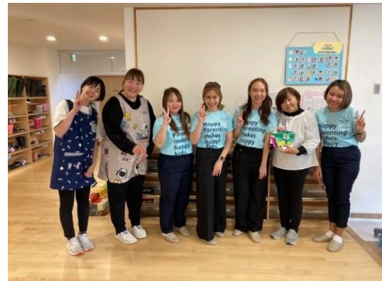
Taihei Azusa Nursery School

The two-day visit and training were very valuable experiences for both the children and teachers. Both the children and the teachers gained many insights and discoveries through their interactions with the teachers from Tonkla School. We were able to actively engage in international exchange, communicating with each other using gestures and English vocabulary, and experiencing each other's unique perspectives.