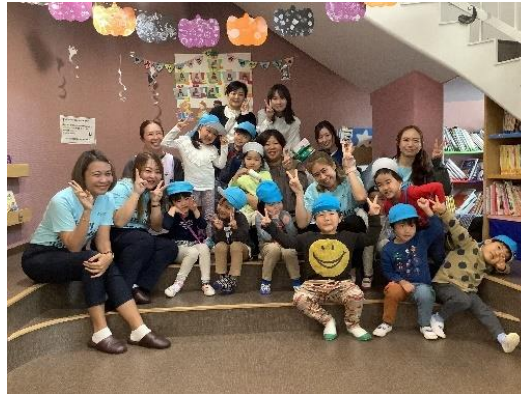
Miyanomori Maple Nursery School