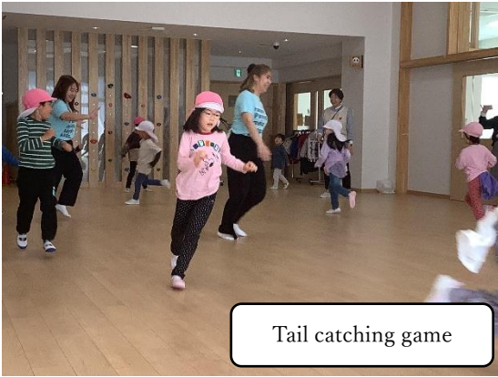
Tail catching game

Nishimachi Satsuki Nursery School The theme of the day's Undo Asobi was to move their bodies while using towels. It was impressive to see the children cooperating with teachers in the race. The tail catching game at the end of the day was very exciting, with both the children and the teachers competing with each other!