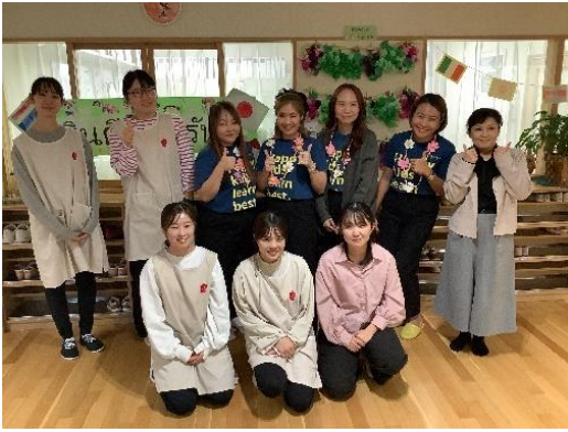
Kitago Ayumi Kindergarten