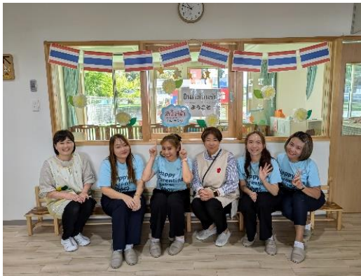
Nishimachi Satsuki Nursery School